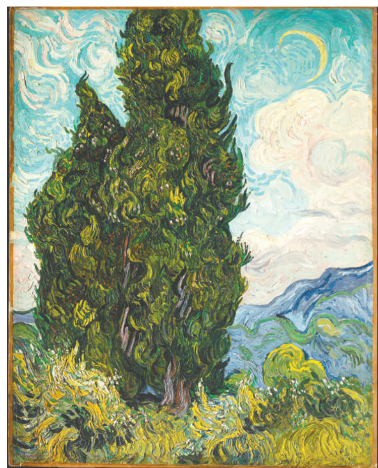
METROPOLITAN MUSEUM OF ART, NEW YORK